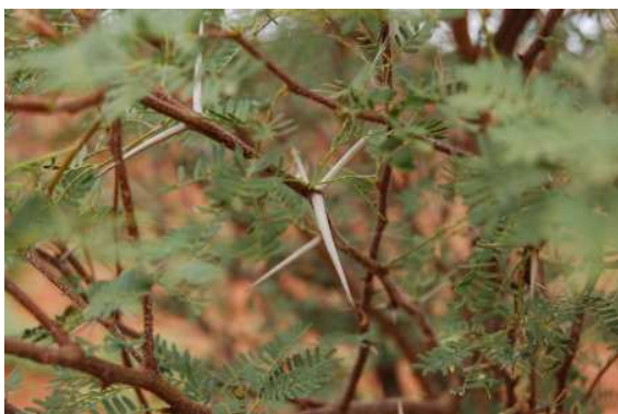
This nasty-looking customer is found over much of our area, but is actually a native – Acacia farnesiana

If you see a plant and you don't know what it is, it's not too hard to find out. Is that spiky thing growing around the bore a weed or a native? The Herbarium located at the Alice Springs Desert Park has experts at identifying the plants of the region.