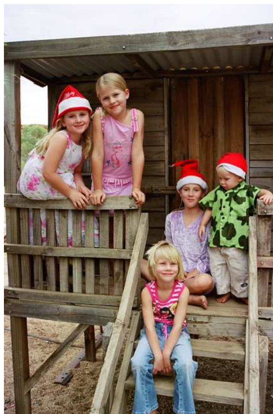
The Hayes kids at Undoolya

Anything else?: The Hayes family has been in the area for over 100 years. They also grow tasty grapes and melons.